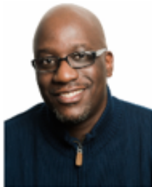
Serenity Family Counseling, LLC Marriage & Family Therapist, MBA, MAMFT, LCMFT

As a psychiatric and behavioral health consultant, I work with people who have a broad spectrum of relationship problems. My areas of expertise are infidelity, divorce, separation, addictions, children with behavioral issues, and men's issues. I am an interactive, solution-focused therapist. I provide support and practical feedback to help you effectively address personal life challenges. I offer a highly personalized approach, tailored to you with complementary methodologies and techniques.