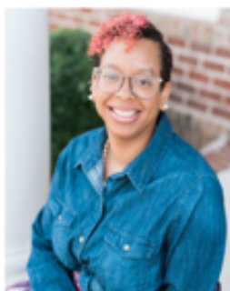
Licensed Professional Counselor, LCPC, NCC

Our individual experiences play a role in shaping our personalities, how we see the world, and how we view ourselves. My goal is to help increase your self-awareness through self-exploration and world-exploration. This approach requires open mindedness, flexibility, and hard work. As a poet, I take a creative approach to nearly all I do, particularly therapy. Life is all about balance and therapy can be emotionally draining work. So I like to make therapy as fun and interesting as possible.